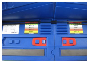
Integrated cable channels & Inter-connecting straps