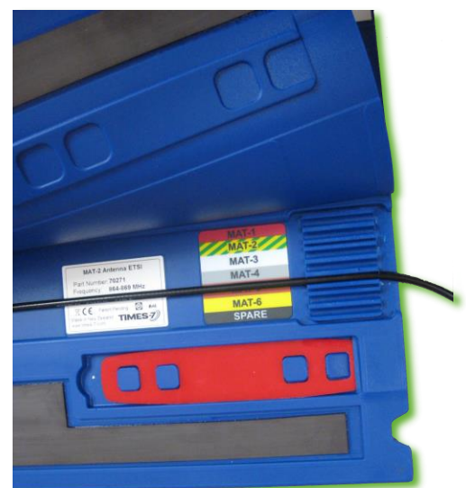
Integrated cable channels – Cable detail

Event and race-proven, the SlimLine RTAS has been extensively stress and performance-tested in hundreds of events around the world, putting this complete race timing antenna system in a class of its own.