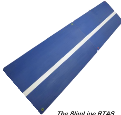
The SlimLine RTAS

Complete race timing antenna system – for deployments of up to 7 antennas